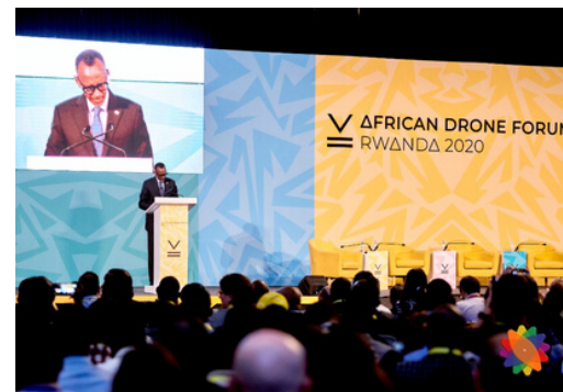
H.E. Paul Kagame delivers opening remarks at the ADF

For more information and press inquiries, please contact us at info@gadacademy.org